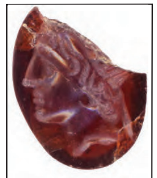
Hellenistic Gemstone with Portrait of Alexander the Great