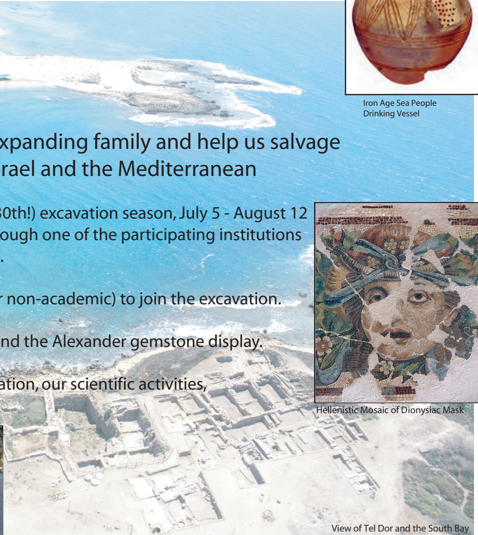
View of Tel Dor and the South Bay

Visit our web site: http://dor.huji.ac.il/