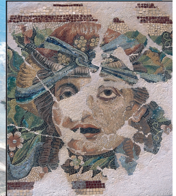
Hellenistic Mosaic of Dionysiac Mask