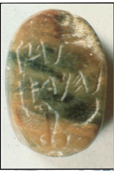
Israelite Seal of Priest of Dor